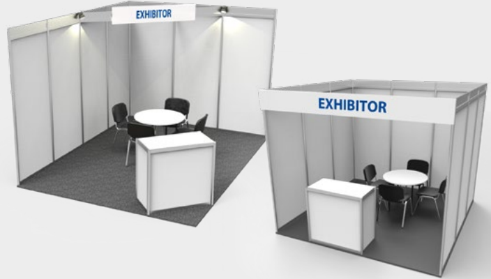
Exhibit space, shell scheme – white walls with aluminium frame, grey carpet, an information counter, a table with 4 chairs, spotlights, a trash can, name board, power supply up to 2kW, daily stand cleaning

CORNER PACKAGE 20 m 2 Discounted price: 6 000 EUR